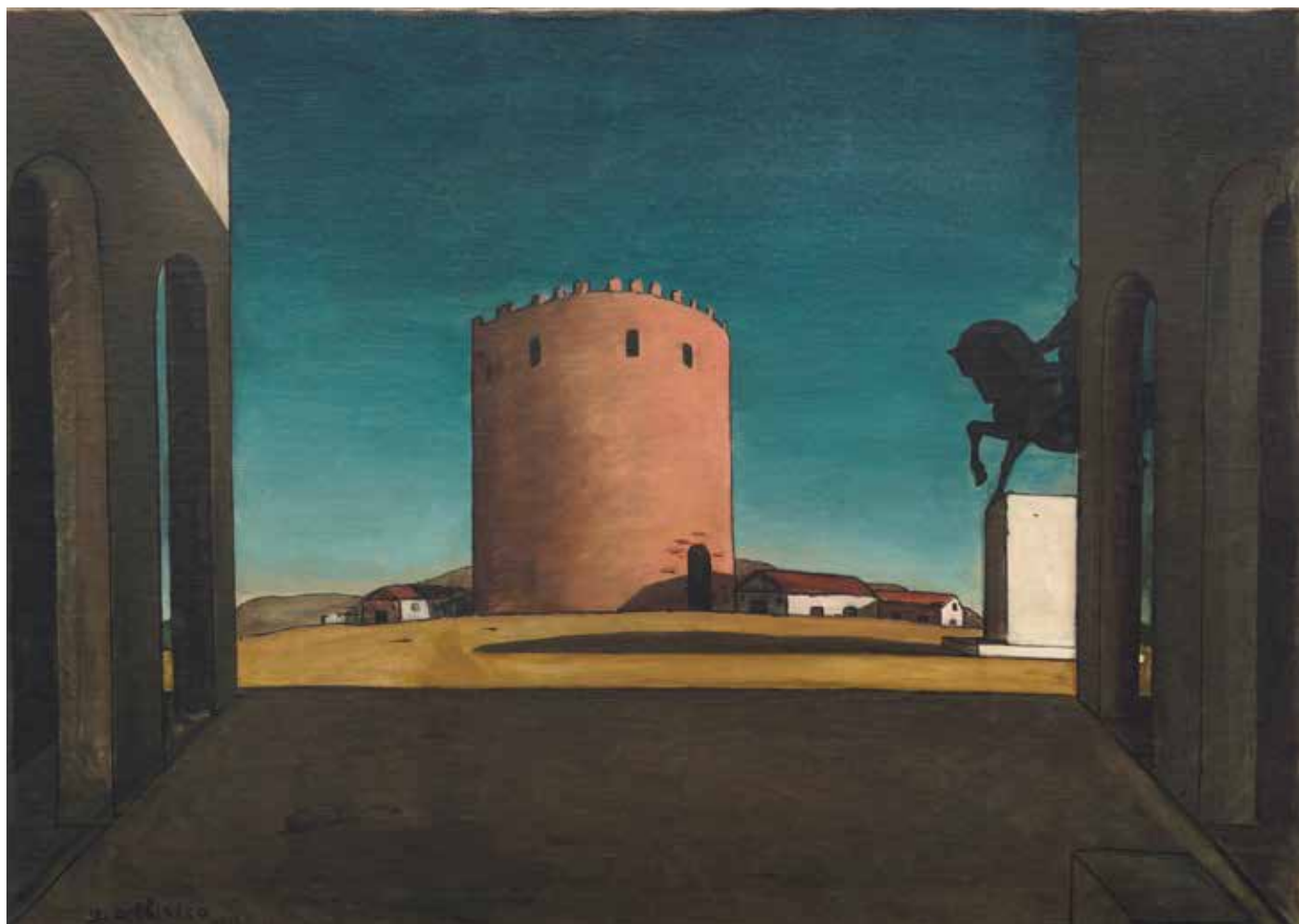
Giorgio De Chirico La Tour Rouge, 1913

Huile sur toile 73,5 x 100,5 cm Venise, Peggy Guggenheim collection © Adagp, Paris 2024