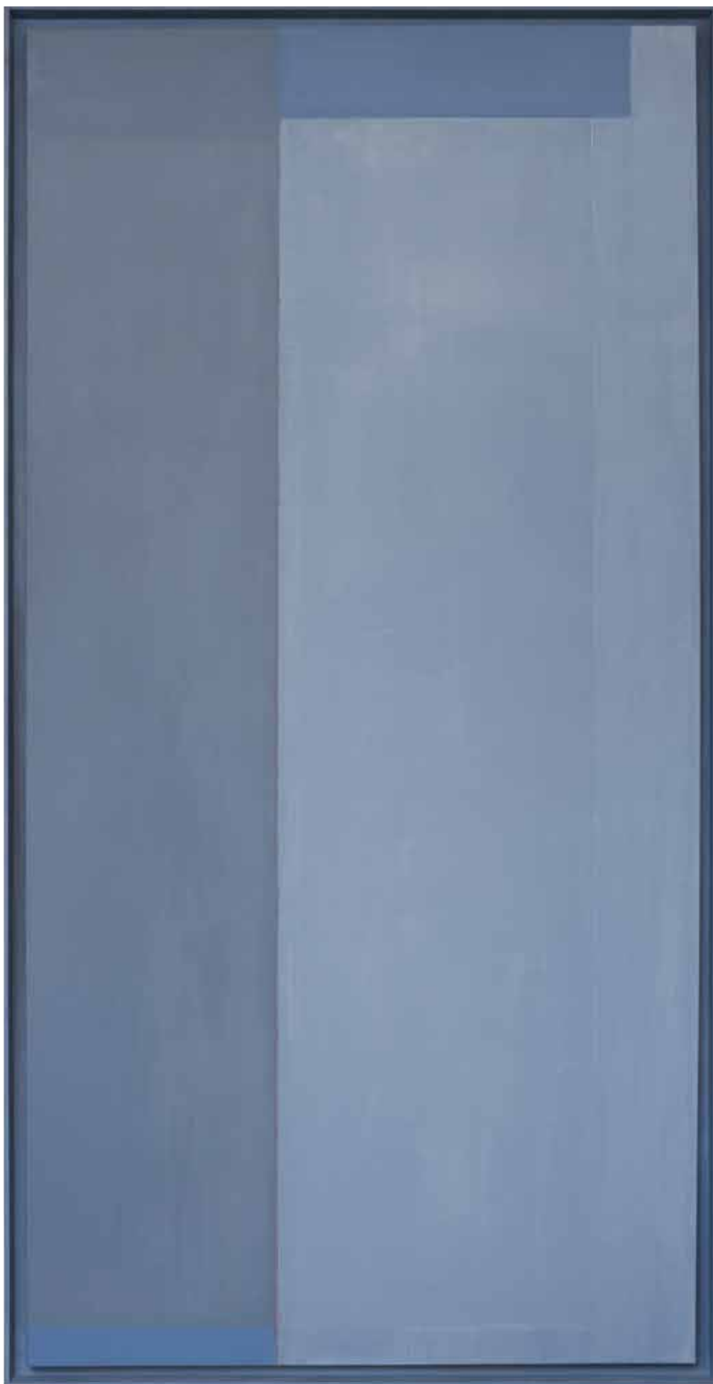
Geneviève Asse Sans titre , vers 1990-2000

Huile sur toile Collection particulière