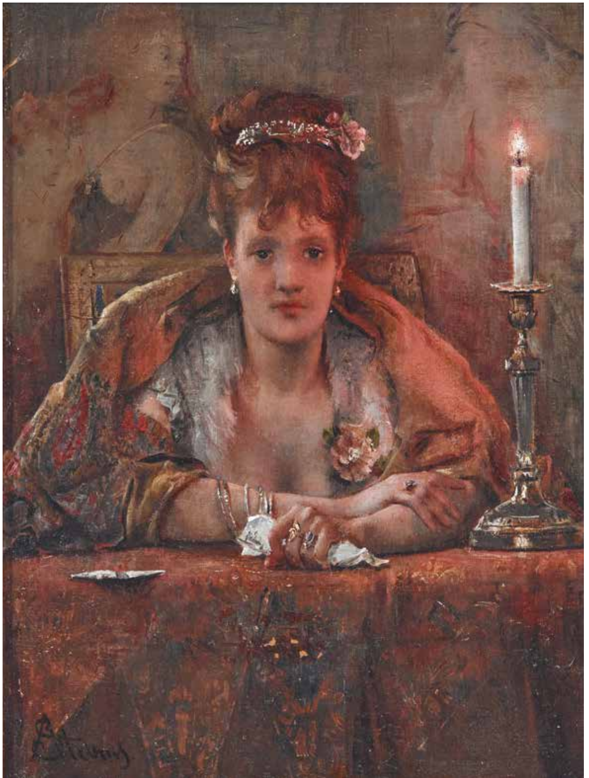
Alfred Stevens Douloureuse certitude , 1861

Huile sur toile, 33, 5 x 25 cm Collection particulière