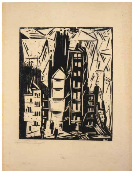
Maisons parisiennes (Old Houses in Paris - Pariser Häuser) , 1919

139 works (4 oil paintings, 24 watercolours, 22 drawings and 89 prints) spanning his entire career, from 1907 to 1949. This first solo exhibition of Feininger's work in France would not have been possible without the generosity of a devoted collector. Because they have been chosen by a collector, these works naturally reflect the life and tastes of an individual. There is a strong emphasis on graphic art and the dazzling series of wood-cuts made in the space of a few years, between spring 1918 and the end of 1920 at the Bauhaus. The artist behind this approachable, poetic body of work is revealed as a man who engaged with the issues of his time, who embraced contemporary utopian ideals, taking part in the founding of the Bauhaus, while exploring individual avenues that produced a lifetime oeuvre of exceptional coherence.