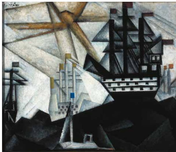
Battle Fleet (Flotte de guerre), 1920

Pen and Indian ink and watercolour on papier Private collection.