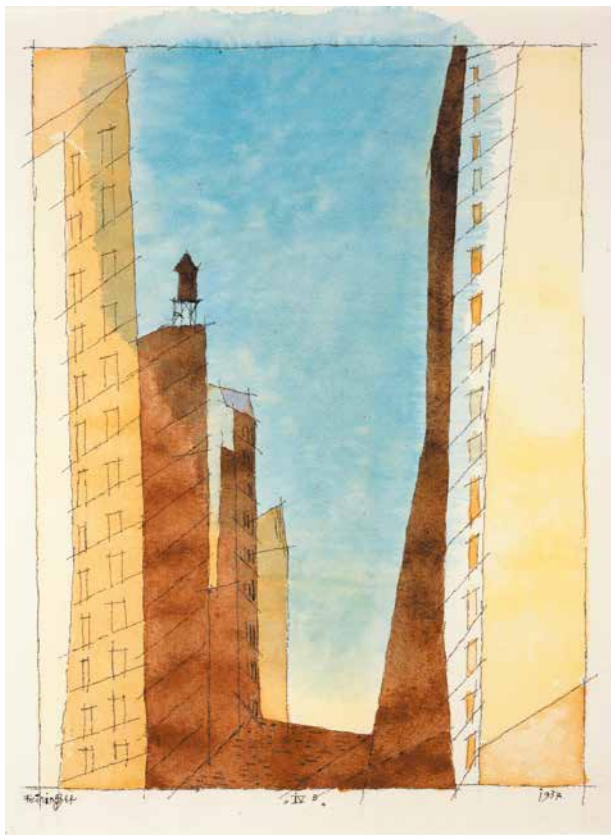
IV B Manhattan, 1937

Pen and Indian ink and watercolour on papier Private collection. © Adagp, Paris, 2015